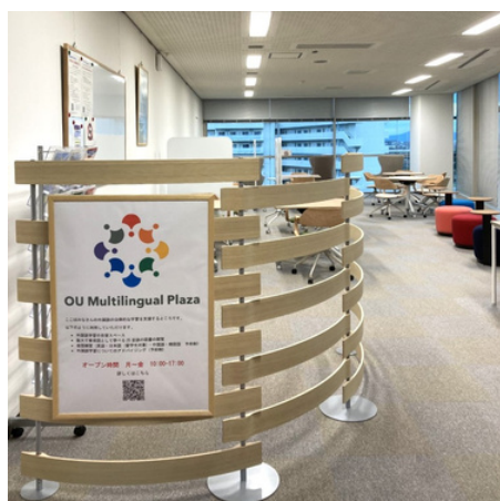
Toyonaka campus: 4F, D3 Center (former Cybermedia Center) OPEN : Mon-Fri 10:00-15:00