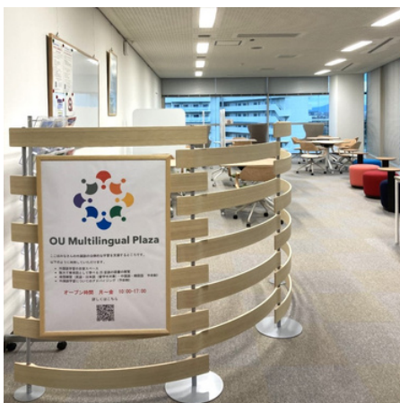
Toyonaka campus: 4F, Cybermedia Center OPEN : Mon-Fri 10:00-15:00