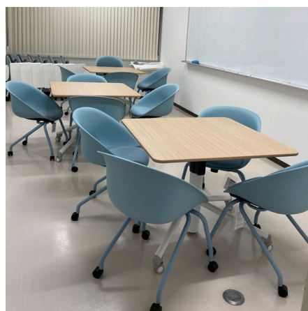
IC-Hall, Suita Campus (OMPIC) 2nd floor (Room4) OPEN : Fri 12:00-13:30

OU Nihongo Hiroba provides information on various resources and Japanese classes for international students.