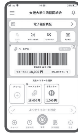
↑ CO-OP membership app

Temporary card(Those with no reception sign are invalid).→ ※Electronic money and meal plans are not available. Please understand.