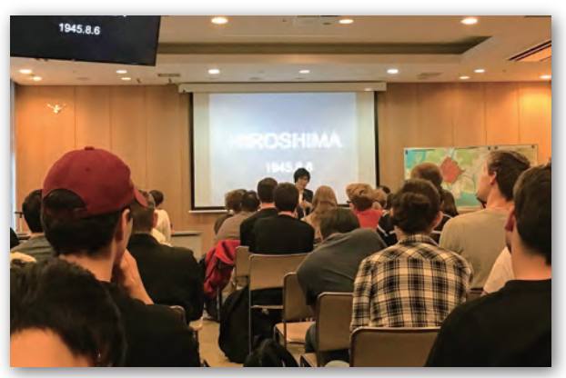
Hiroshima Peace Memorial Museum