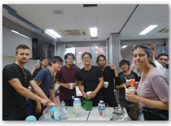
Shaved Ice Party