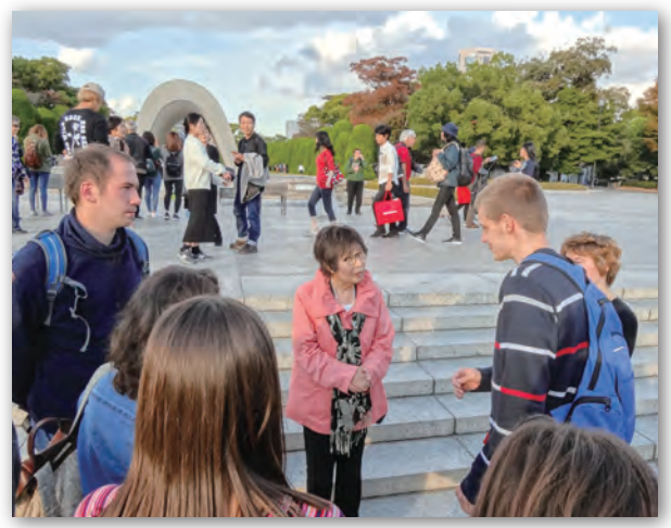
Hiroshima Peace Memorial Park

*Participants who enroll in the Internship will be unable to take CIEE Japanese classes due to schedule conflicts.