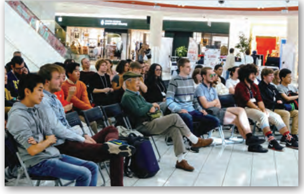
My Country/Region My University