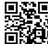
CIEE Japanese Language program