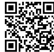
OU Ninohgo Hiroba