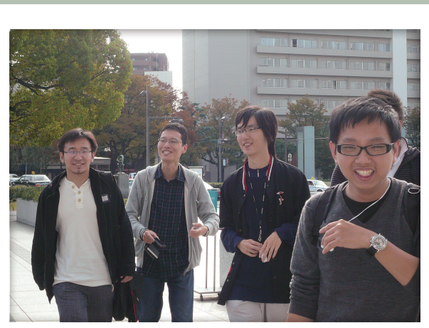
Hiroshima Peace Park