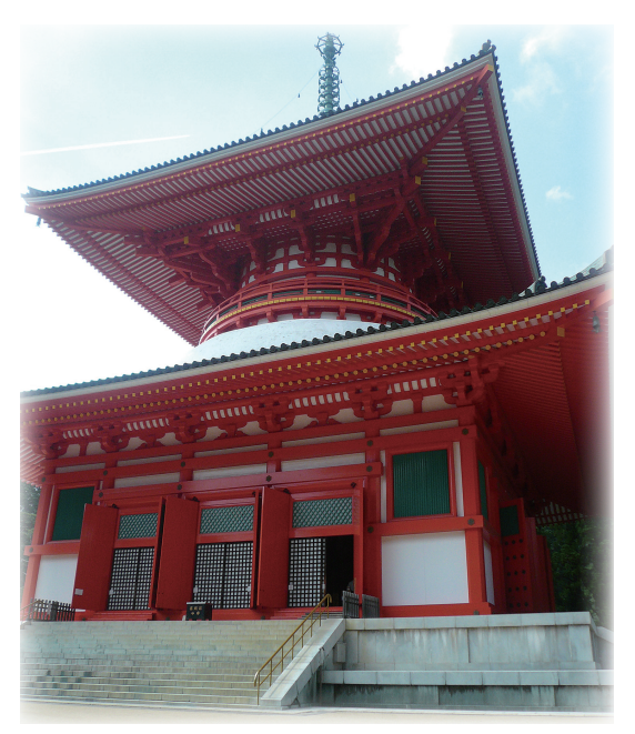
Farewell Trip to Koya-san