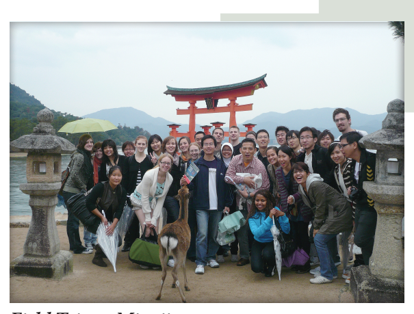
Field Trip to Miyajima