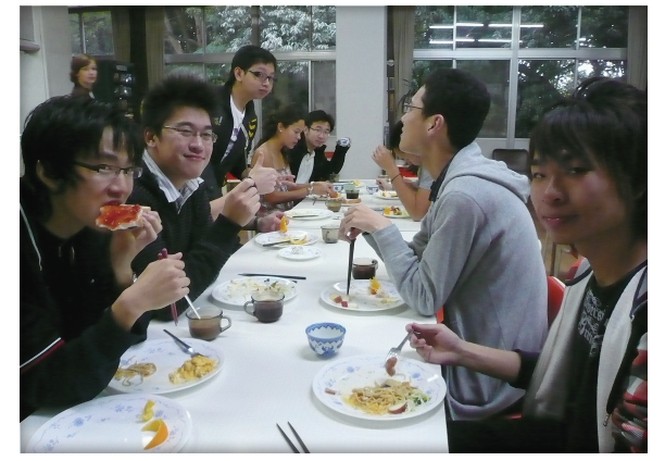
Hiroshima Youth Hostel