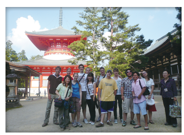
Farewell Trip to Koya-san