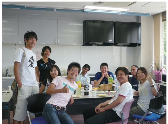
Brothers & Sisters Program

Some students may have already bought international insurance in their home countries, and are not pleased to have to join the above plan provided by the University. Note that in the event they need personalized certified translations for their own insurance companies, such as medical certificates or police accident reports, the University is not able to translate these official documents. Students will need to find professional translation services by themselves outside the University.