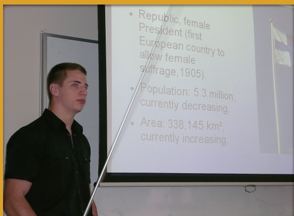
Introduce My Country & My University