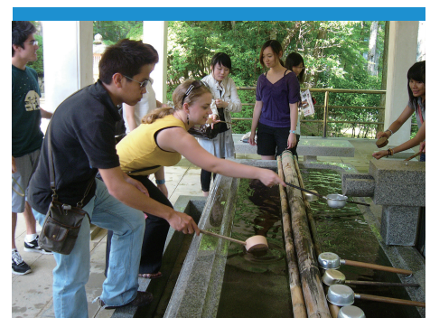
Farewell Trip to Koya-san