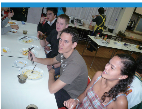
Farewell Trip to Hiroshima