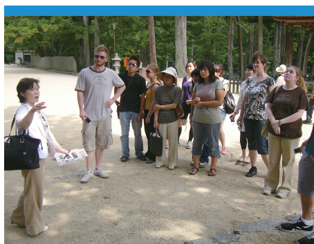
Farewell Trip to Koya-san