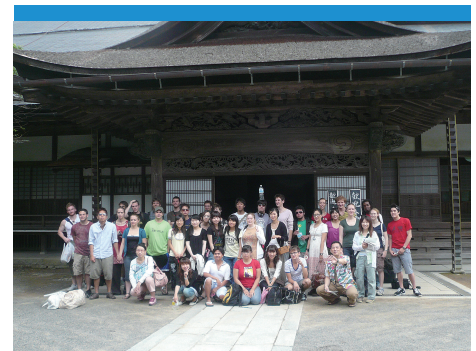
Farewell Trip to Koya-san