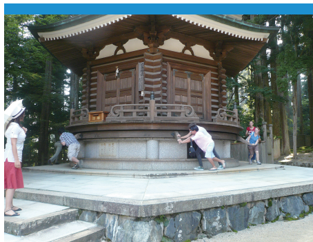
Farewell Trip to Koya-san