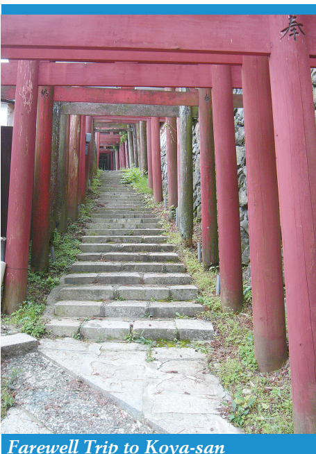
Farewell Trip to Koya-san

In order to prevent the spread of avian influenza together with new strains of influenza, and thus maintain the university's pleasant education and research environment, Osaka University has issued the guidelines for their prevention. In order to promote the early detection of any cases of the above illnesses, and thus decrease the sphere of possible infection, all members of Osaka University, including OUSSEP students, are expected to respect these guidelines, which are enclosed in the application package.