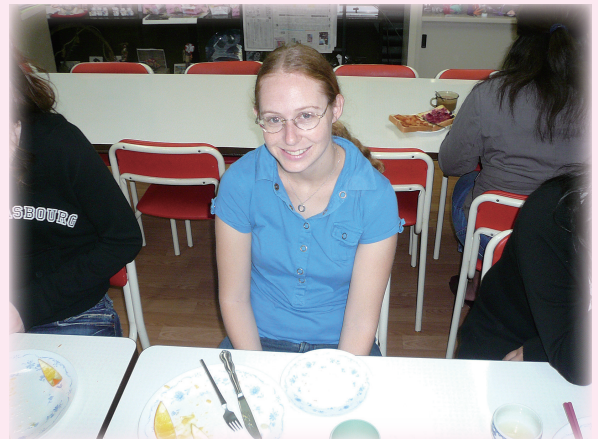
Breakfast at Hiroshima Youth Hostel