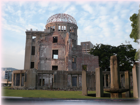
Field Trip to Hiroshima

The OUSSEP programs offer field trips for students in order to give them opportunities to see as many things and to meet as many people as possible during their full-year or half-year stay in Japan. They visit industries and public institutions as a part of the academic courses and also go on trips, including overnight trips, to different parts of the country to meet local people and to experience the local culture.