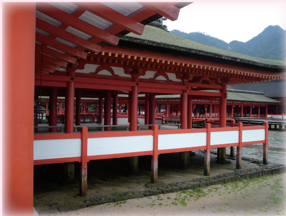
Field Trip to Miyajima

The OUSSEP programs offer field trips for students in order to give them opportunities to see as many things and to meet as many people as possible during their full-year or half-year stay in Japan. They visit industries and public institutions as a part of the academic courses and also go on trips, including overnight trips, to different parts of the country to meet local people and to experience the local culture.