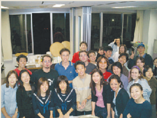
Exchange with High-school Students

In addition to the academic programs, students are encouraged to participate in various international exchange activities throughout the year, which the ISC and CJLC organize. Other groups including those within the University (such as the student-organized international exchange group of Brothers and Sisters Program (BSP)), as well as those in neighboring communities, also participate in these programs. One example of a neighboring community group is the Osaka University Host Family Program (OHP), which is coordinated by the ISC and provides international students with an opportunity to closely interact with a local Japanese family living nearby the university.