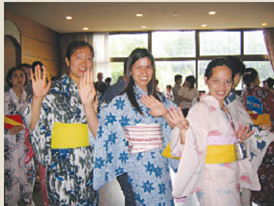
Exchange Event in Yukata