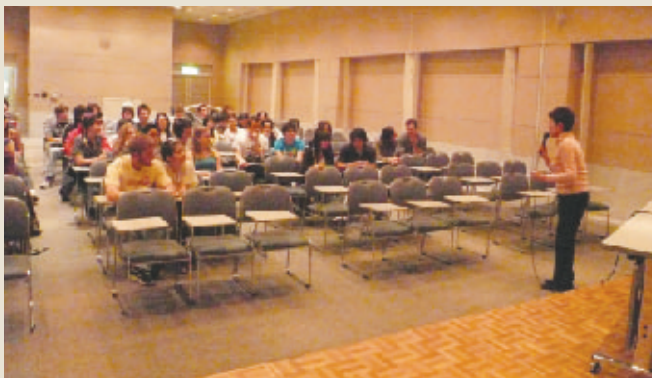
Seminar by an A-Bomb victim at Hiroshima

The OUSSEP programs offer field trips for students in order to give them opportunities to see as many things and to meet as many people as possible during their full-year or half-year stay in Japan. They visit industries and public institutions as a part of the academic courses and also go on trips, including overnight trips, to different parts of the country to meet local people and experience local cultures.