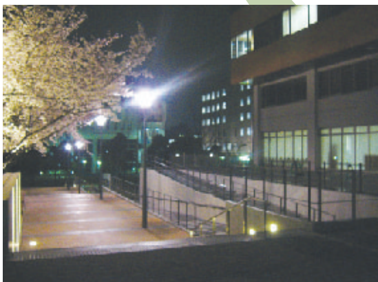
ISC at Night (Suita)