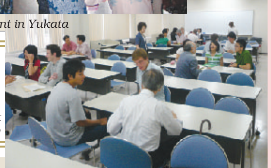
Meeting with Host Family