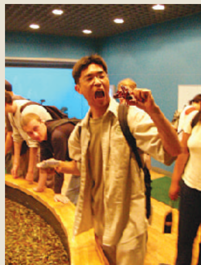
Field Trip to Biwa Lake Museum