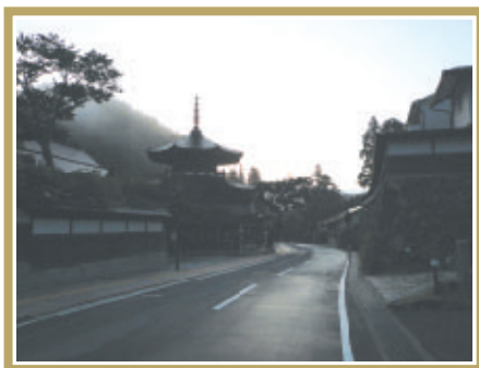
Morning calm (Koya-san)

In late May, upon approval by the committee, Osaka University will immediately file JASSO applications for those applicants selected, except for those who do not need the scholarship. At the same time, Osaka University will officially notify the applicants and their home universities of the decision regarding admission to OUSSEP . We will notify those admitted and their home universities of the official decisions concerning JASSO Scholarships by the end of June 2008.